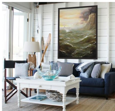
D.Salov Cape Sounion with Temple of Poseidon oil on canvas 70x50 cm, 1995 Price 1.200€