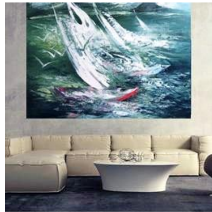
V.Franchuk The Wind Catchers oil on canvas 90x108cm 2003 Price 4.200€