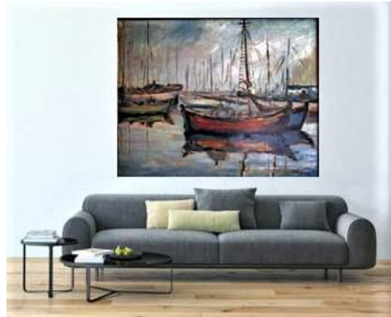
Unidentified, Boats at the Pier oil on canvas the beginning of the 20 th century Price 2.500 €